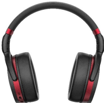
The HD 458BT features a fresh new look with bold red accents that lift the minimalist design to new heights